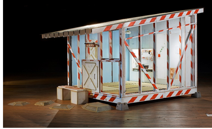
《Tea House》 2011-16

*All reference images \operatorname{@Tom} Sachs and courtesy of Tomio Koyama Gallery